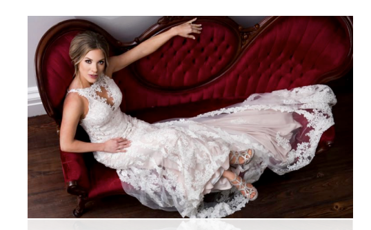
BRIDAL PACKAGE $600